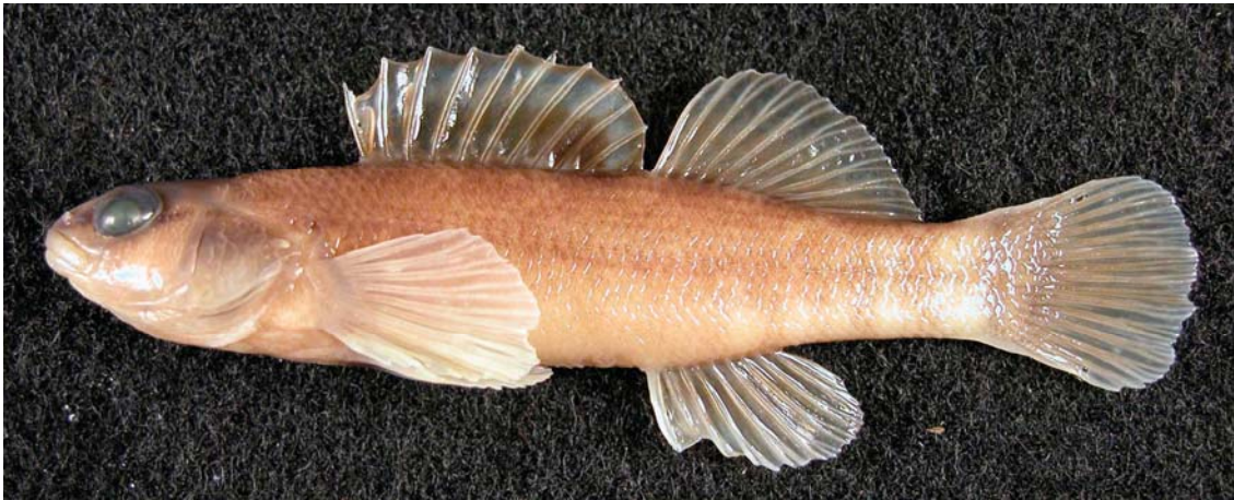
Figure 1. Etheostoma thompsoni , Holotype. TU 200366, Adult male 53.7 mm SL, Neches River, along right (west) bank just below Town Bluff dam, at Town Bluff, Tyler County, Texas, 16 February 1979.

Etheostoma asprigene : Moore, 1968 (portion of range in Sabine and Neches river systems); Starnes, 1980 (distribution in Sabine and Neches river systems); Page, 1983 (portion of range in Sabine and Neches river systems); Cummings et al. 1984 (portion of range in Sabine and Neches river systems); Conner and Suttkus, 1986, (portion of range in Sabine Lake and Calcasieu drainage); Page and Burr, 1991 (portion of range in Sabine-Neches river drainage); Thomas et al. 1998 (portion of range in Sabine and Neches river systems).