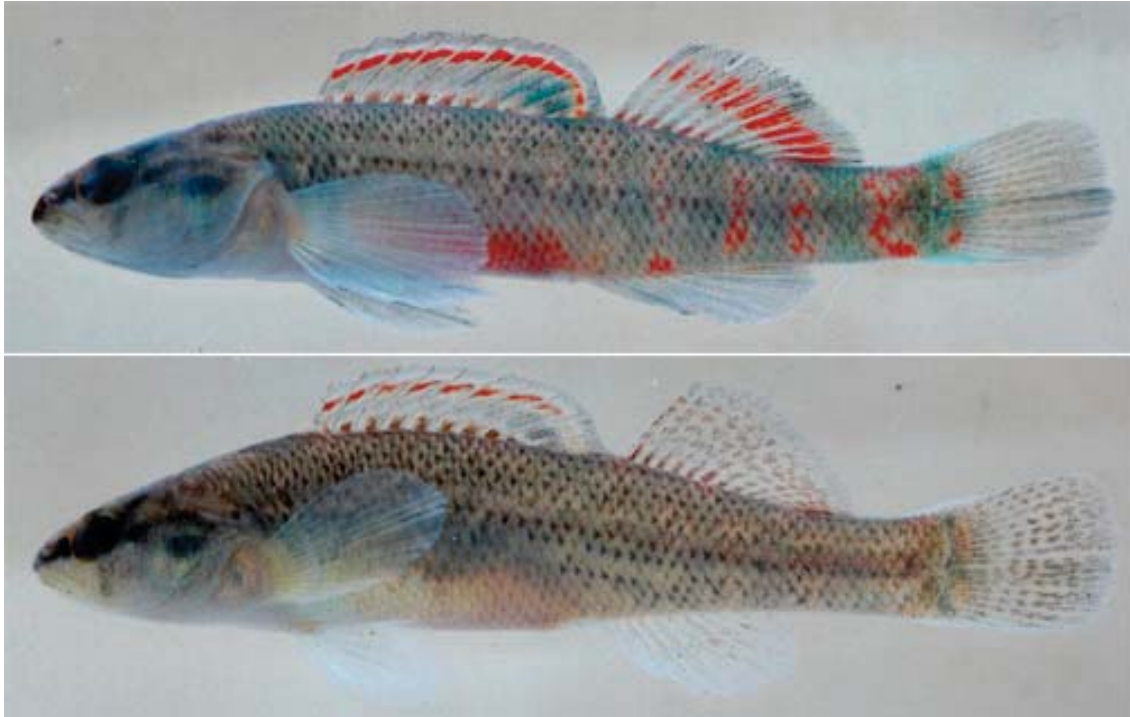
Figure 2. Recently collected (March 2008) paratypes of E. thompsoni showing nuptial coloration of male (top) and female (bottom).

Etheostoma thompsoni reaches a maximum size of 61 mm SL (a female). This single female specimen greatly exceeds the largest male (holotype, 53.7 mm SL). Frequency distributions of scale and fin ray counts are presented in Tables 1-6. Lateral line usually incomplete: total lateral-line scales range from 44-52 (42-54); pored lateral-line scales 34-45 (31-48); unpored lateral-line scales (0, 1 specimen), 4-13 (1-18). Caudal peduncle scale rows 20-22 (18-24). Transverse scale rows 14-17 (-18). Dorsal fin with 10-11 (9-12) spines and 12-14 (11-15) soft rays. Anal fin with 2 spines and 7-8 (6-9), modally 7 soft rays. Pectoral-fin rays 14-15 (12-16), modally 14 rays. Branchiostegal rays (all from Neches River system) number 6-6 (30), 6-7 (1), or 7-7 (1). Cephalic sensory canals (left side only, all from Neches River system) complete with 9 (1), 10 (77), or 11 (1) preoperculomandibular canal pores; 7 (1), 8 (65), 9 (12), or 10 (1) infraorbital canal pores; and 4 (46) or 5 (1) supraorbital canal pores. Gill rakers (Neches River system) 10(3), 11(11), 12(11), or 13(7). Branched caudal rays, scalation of cheek, opercle, nape, and prepectoral area, proportional measurements, and morphometrics discussed under "Comparisons".